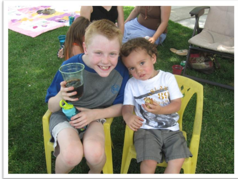
2011 MEKA Summer Picnic July 16